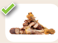
Meat and fish bones