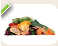
Fruit and vegetable peelings