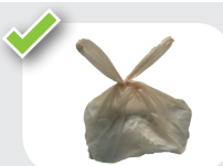
Nappies (in a tied bag)