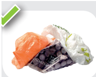
Plastic bags and film