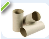
Toilet and kitchen roll tubes