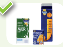
Food and drinks cartons

move film lids from plastic pots, tubs and trays.