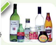
Glass jars and bottles