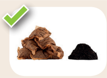
Tea bags & coffee grounds