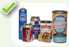
Cans, tins, aerosols and tin foil