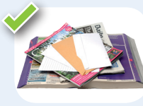
Junk mail and catalogues